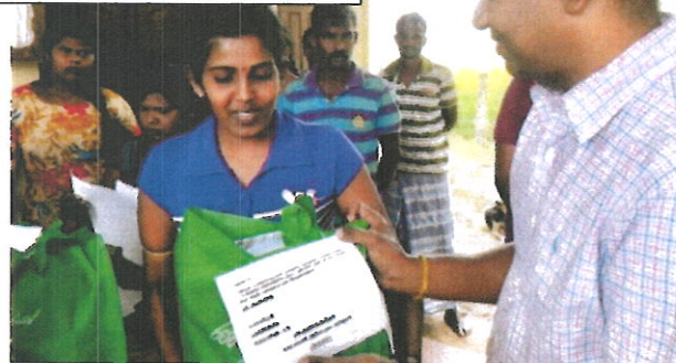
Above: December 2018 flood relief with