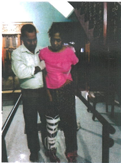
Above: April 2019 Easter Bomb victim